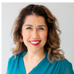
Director at Large