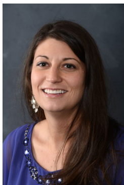
Director at Large