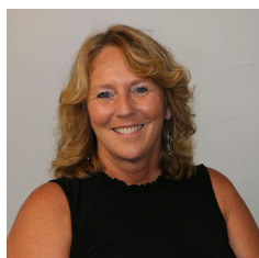
Director at Large